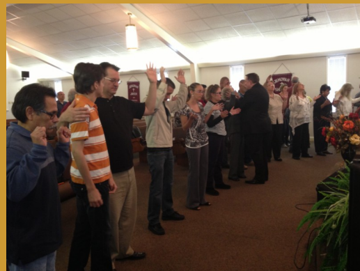
Healing line at Gleaner Church, Alvin, TX.