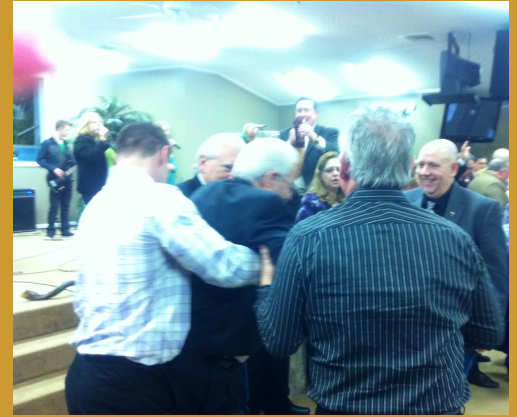
Receiving a touch from God at Church of the Living Waters, Deer Park, TX.

Many coming down for Salvation Prayer, in Deer Park, TX.