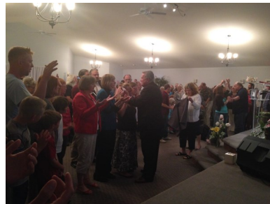
Abundant Life Outreach Center Eagle River, WI