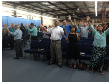
Living Word Church Chesterfield, SC