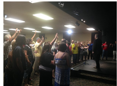
Calvary Temple Church Edmond, OK