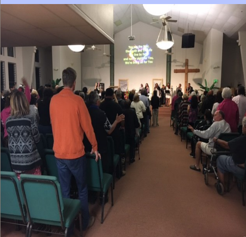
Aloha Church in Kauai, Hawaii.